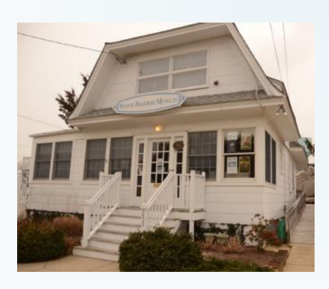
Original Stone Harbor Museum

Visit us at our <u>Website</u> to get all of the latest info on the Museum !