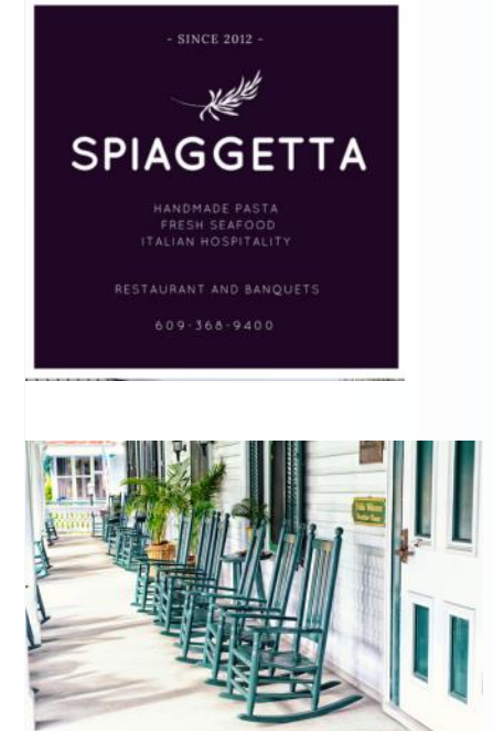
Cape May County Board of County Commissioners