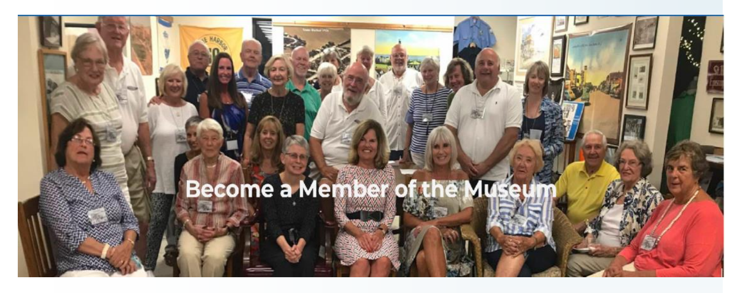
The 2021 Membership Drive will begin in a few weeks!

The Stone Harbor Museum depends heavily on annual memberships for income. Funds are used to pay for new window displays, new interior displays, IT expenses to keep the Web Page running, and, like you, to pay our monthly bills. We know that this is a difficult time to be asking for money, so any help you can provide is sure to help the Museum.