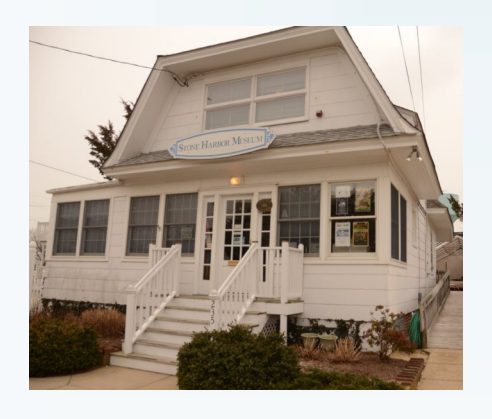
Original Stone Harbor Museum