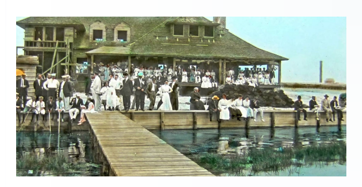
Stone Harbor Yacht Club—under construction

The Museum is about to begin the conversion of all of their pictures, documents, books, etc. into digital images that can be viewed on our Web Page.