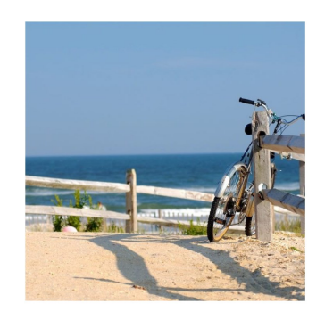
Cape May County Board of Chosen Freeholders, Dept of Tourism, Public Information and Culture & Heritage