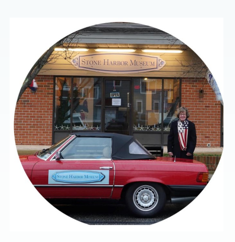
Current Stone Harbor Museum

Funding has been provided in part by the New Jersey Historical Commission//Dept of State, the New Jersey State Council on the Arts, Dept. of State, the National Endowment for the Arts, and the Cape May County Board of Chosen Freeholders through the Cape May County Dept of Tourism, Public Information and Culture & Heritage.